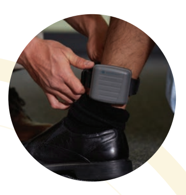
Install the SCRAM House Arrest bracelet in less than a minute