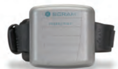
SCRAM House Arrest®