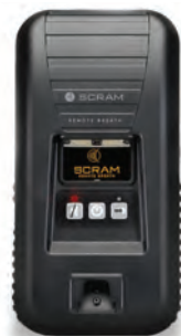
SCRAM Remote Breath®